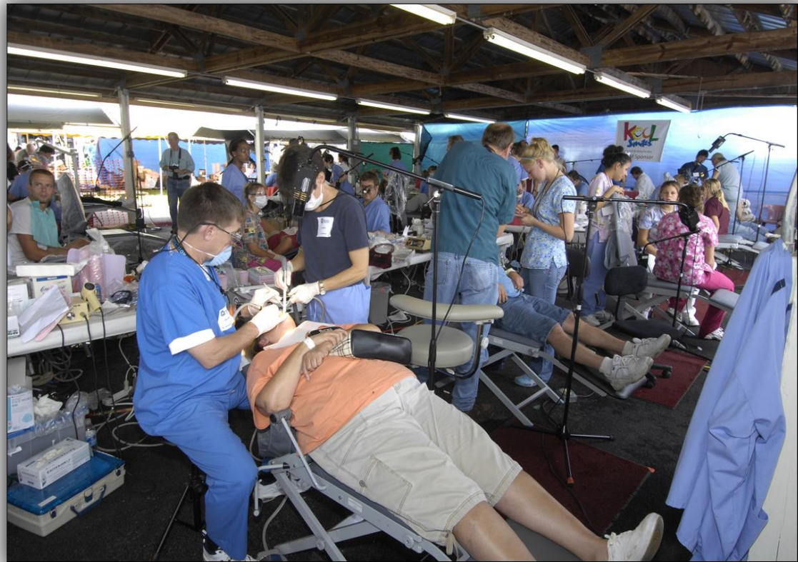
Remote Area Medical (07-20-07) Wise, VA