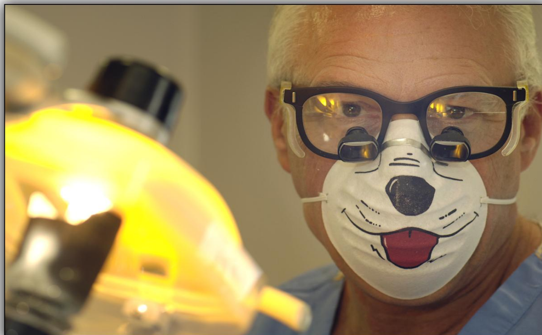
Remote Area Medical (07-20-07) Wise, VA