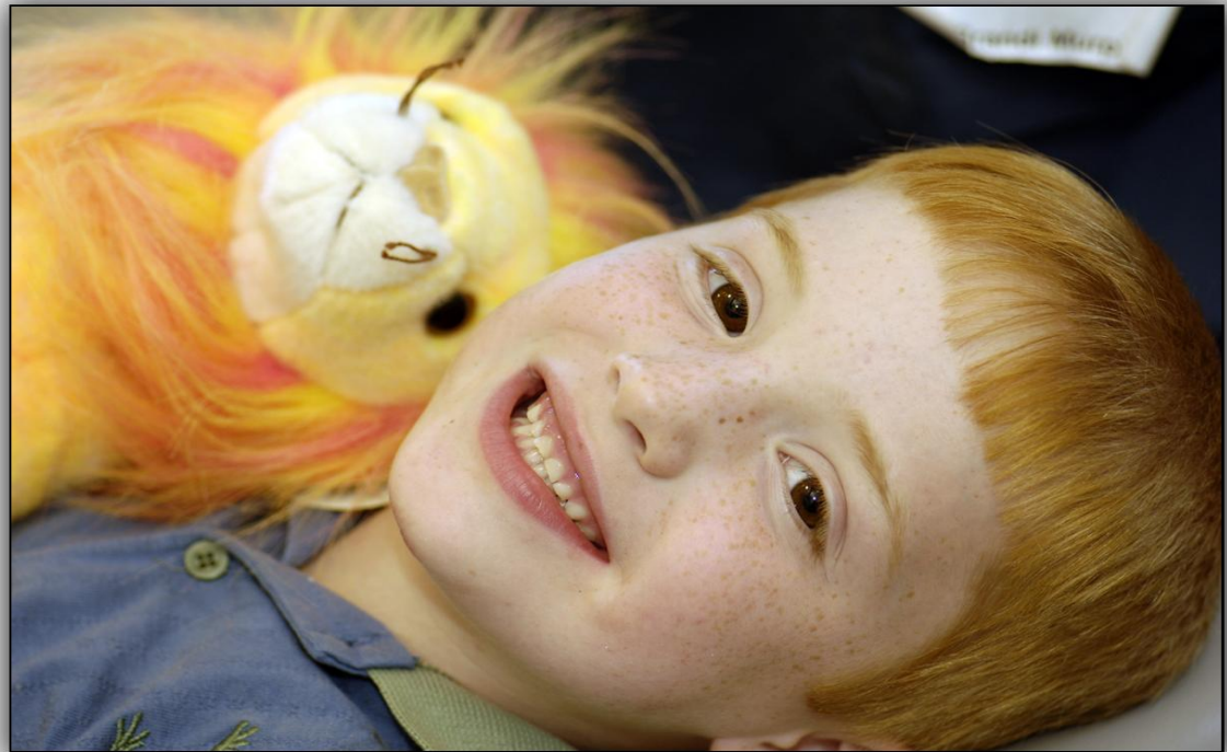
Remote Area Medical (07-20-07) Wise, VA