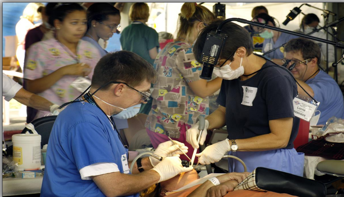
Remote Area Medical (07-20-07) Wise, VA