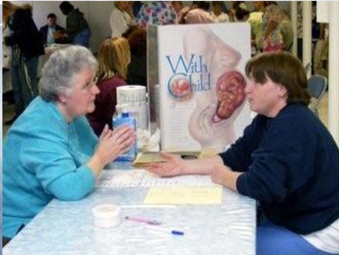
2009 Clintwood Health Fair