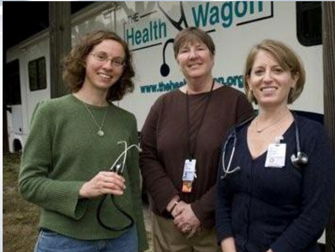
Endocrinology Team from UVA